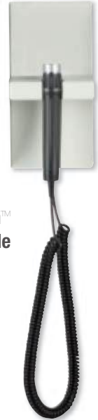
Diagnostix™ Adstation™ Wall Extension Module