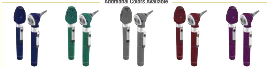
Additional Colors Available

ADC's pocket instruments and sets provide compact portability with feature-rich design. Instruments all use our AA handle with integrated pocket clip (see page 9), with your choice of 2.5V fiber-optic Pocket Otoscope (see page 5) and our 2.5V Pocket Ophthalmoscope (see page 6) instrument heads. Lighting options include xenon illumination, for a brighter, whiter light (3,200K), or our high-performance AdLED lamps (4,200K). Instruments are available individually or in complete, two-instrument sets, in your choice of black or one of five new colors: green, royal blue, purple, burgundy, or gray. Also includes a hard fitted or soft nylon storage case, batteries, disposable specula (with purchase of otoscope), and spare lamps (for all models except 5110E series). Components manufactured in Dubai. Inspected, assembled, and packaged in the U.S.A. Two-year warranty on instruments, lifetime warranty on LED lamp.