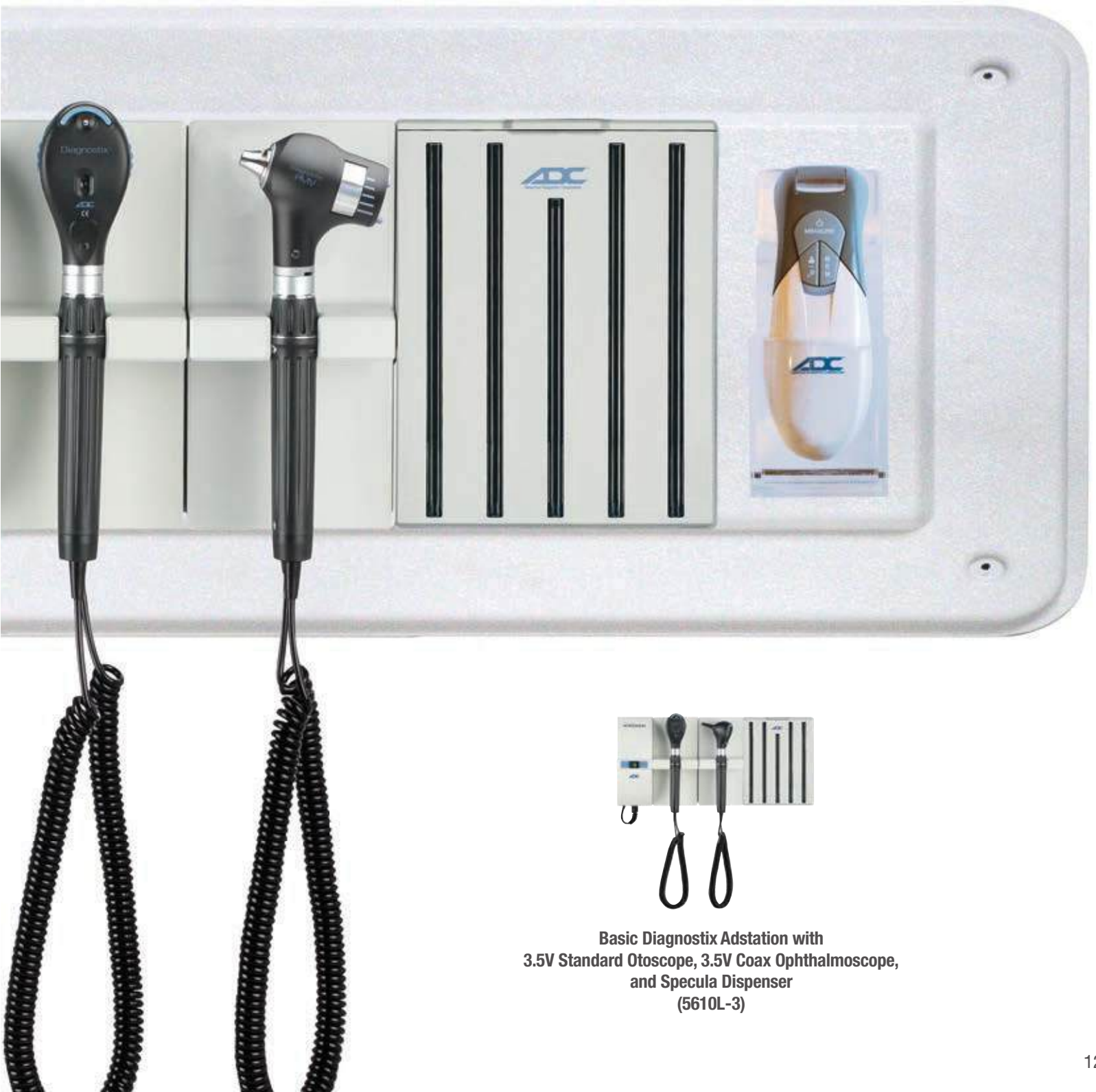
Basic Diagnostix Adstation with 3.5V Standard Otoscope, 3.5V Coax Ophthalmoscope, and Specula Dispenser (5610L-3)