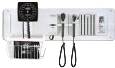
Diagnostix Adstation with Clock Aneroid, 3.5V PMV Otoscope, 3.5V Coax Ophthalmoscope, Specula Dispenser, and Non-Contact Thermometer (5680L-347W)