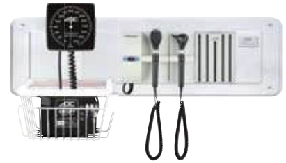
Diagnostix Adstation with Clock Aneroid, 3.5V Standard Otoscope, 3.5V Coax Ophthalmoscope, and Specula Dispenser (5610L-37W)