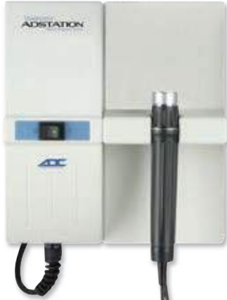
Diagnostix™ Adstation™ Wall Transformer